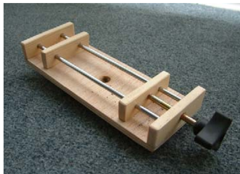
Without Caldwell top showing rails and adjuster.

I have a Caldwell 'The Rock' front rest as do quite a few members now. This rest is good but I feel it would be better with a 'windage top'. After deliberating on purchasing one from the US I thought it would be good to design one and have it made up over here and for less. Well I went out to the garage one Saturday and built a wooden mock up. The photos below are of the basic mock up and as soon as a proto type is made we will let you know.