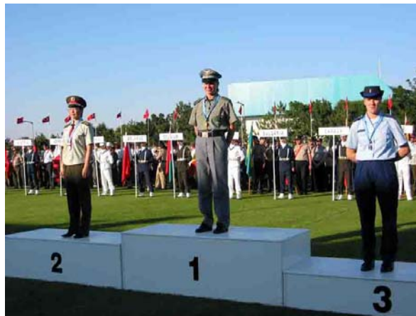
The podium on Turkey