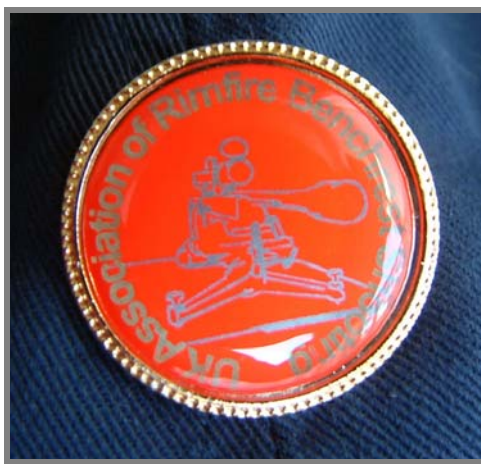
Association pin Badge see Web Page for reasonable purchase cost