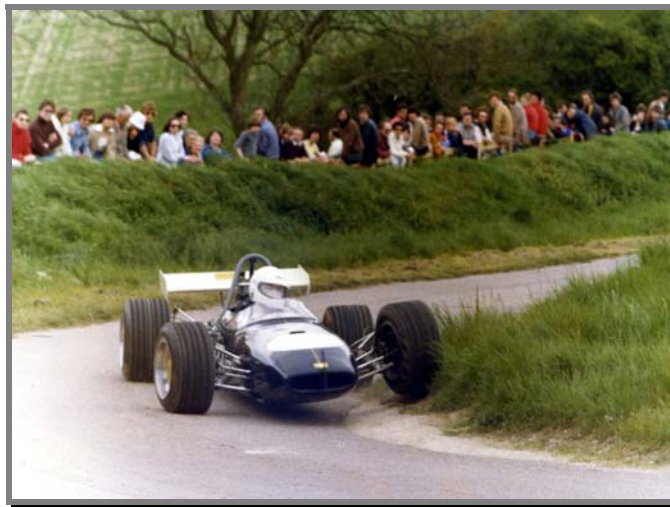
This was fun.....