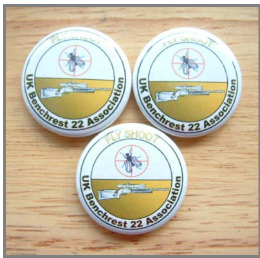
Fly Shoot Button Badges.

As many of you will know Carl has organised a Christmas Fly Shoot, this can be shot at 25 yards and with a different target at 50M. The targets can be down loaded from the Web Page on to A4 paper each of which have 10 flies to hit, the simple Rules are set out on the Target. Carl has organised Badges as rewards for good scores, there are plenty of them, so have a go, it's just for Fun.