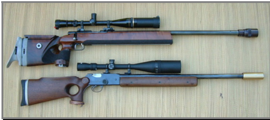
Martini International Mk 3 and Anschutz 1413

Well I'm a grey haired old man of 61 going on 25, some days, and I have only been shooting rimfire for 2 years. Well I'll start at the beginning.....When I was 14 I joined a local shooting club in Sussex where we lived, we were shooting in those days the BSA Martini International, probably the Mk 1 or maybe Mk 2, I was eventually put into the club Team but being very shy could not take the strain did not do very well. I have always liked the Martini so recently when I had the chance to purchase a Mk 3 second hand I did and never looked back, that's the rifle I use solely for 25 yards with a Hawke 40X scope.